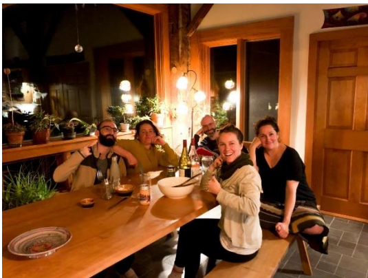
L4E winter Retreat

Please keep contributing with your papers, events, videos, blogs, pictures, ideas etc.